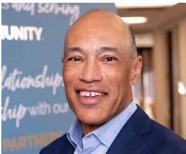
Arnold Pinkston Edwards Lifesciences