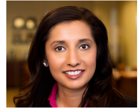
Reshma Block Tricon Residential